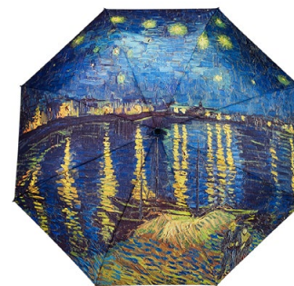
Galleria: van Gogh Starry Night

Galleria umbrellas offer much more than just protection against a very British summer. Their beautiful canopy designs feature colourful works of art, floral prints, birds, abstract patterns and stunning city scapes. These umbrellas really are something special and will be sure to stand out from the crowd. Each Galleria umbrella comes in a gift box, making them great presents.