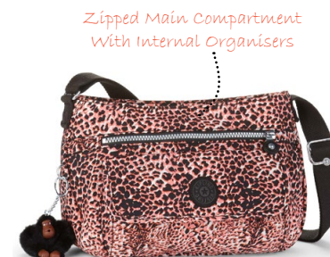
Syro: Fiesta Animal