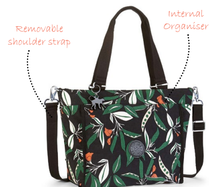
New Shopper S: Latin Flower