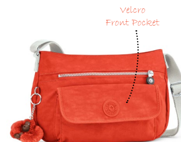
Syro: Coral Rose