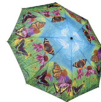
Galleria: Butterfly Mountain