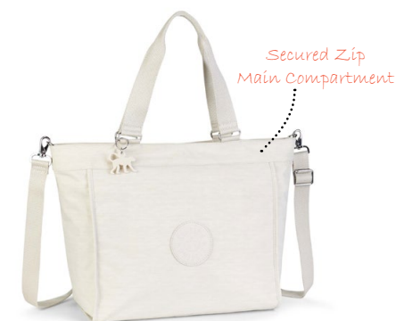
New Shopper S: Dazzling Cream