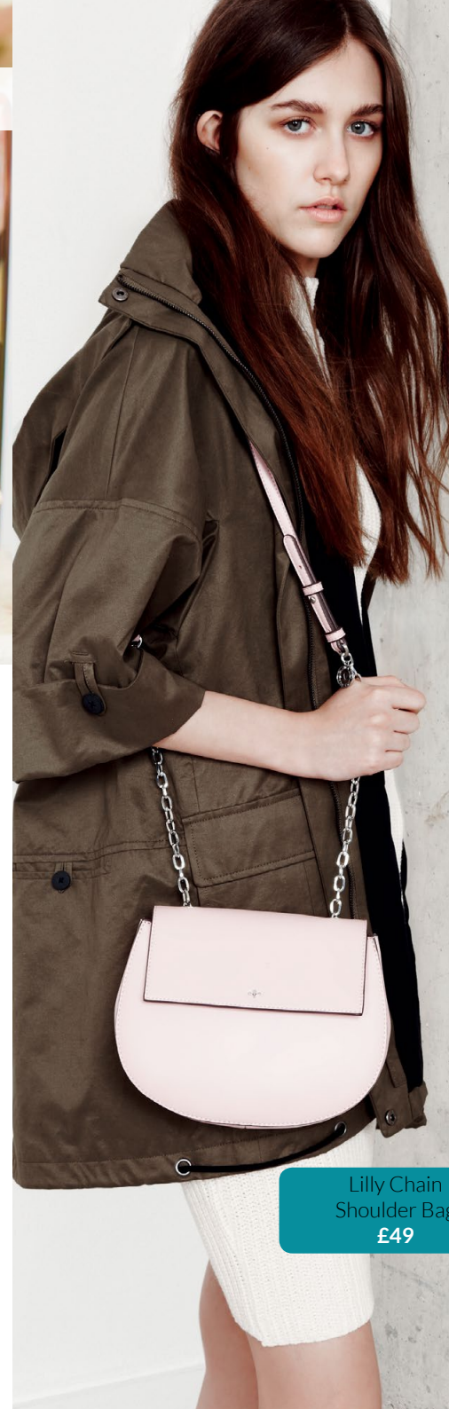
Lilly Chain Shoulder Bag £49

The ranges have a fashion edge and distinctive handwriting, perfect for women who want to wear a trend but show their individuality at the same time.