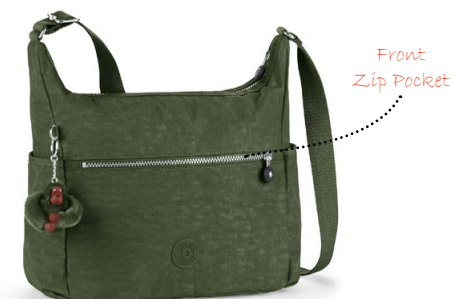
Alenya: Cactus Khaki